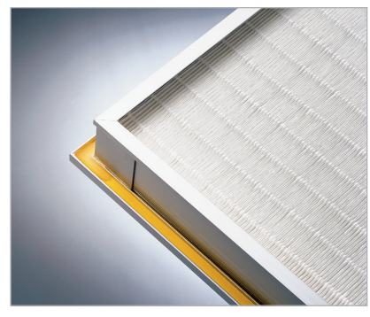
Gel Seal Frame

The AstroCel II LPD Series filter with knife-edge cell sides was designed specifically for gel seal grid systems.