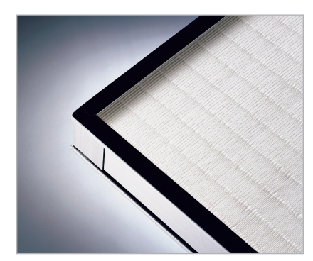
Neoprene Gasket Seal Frame