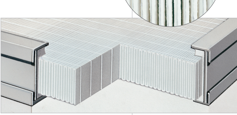
Compact media pack available in sizes from 2" to 4" deep.

Ribbons of media maintain pleat separation which significantly increases airflow.