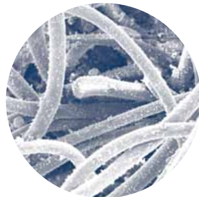
Polyester Bag–Clean Air Side (300x)